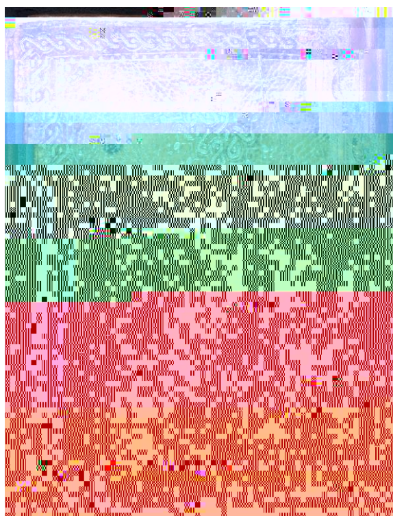
MS 333, binding, front board exterior